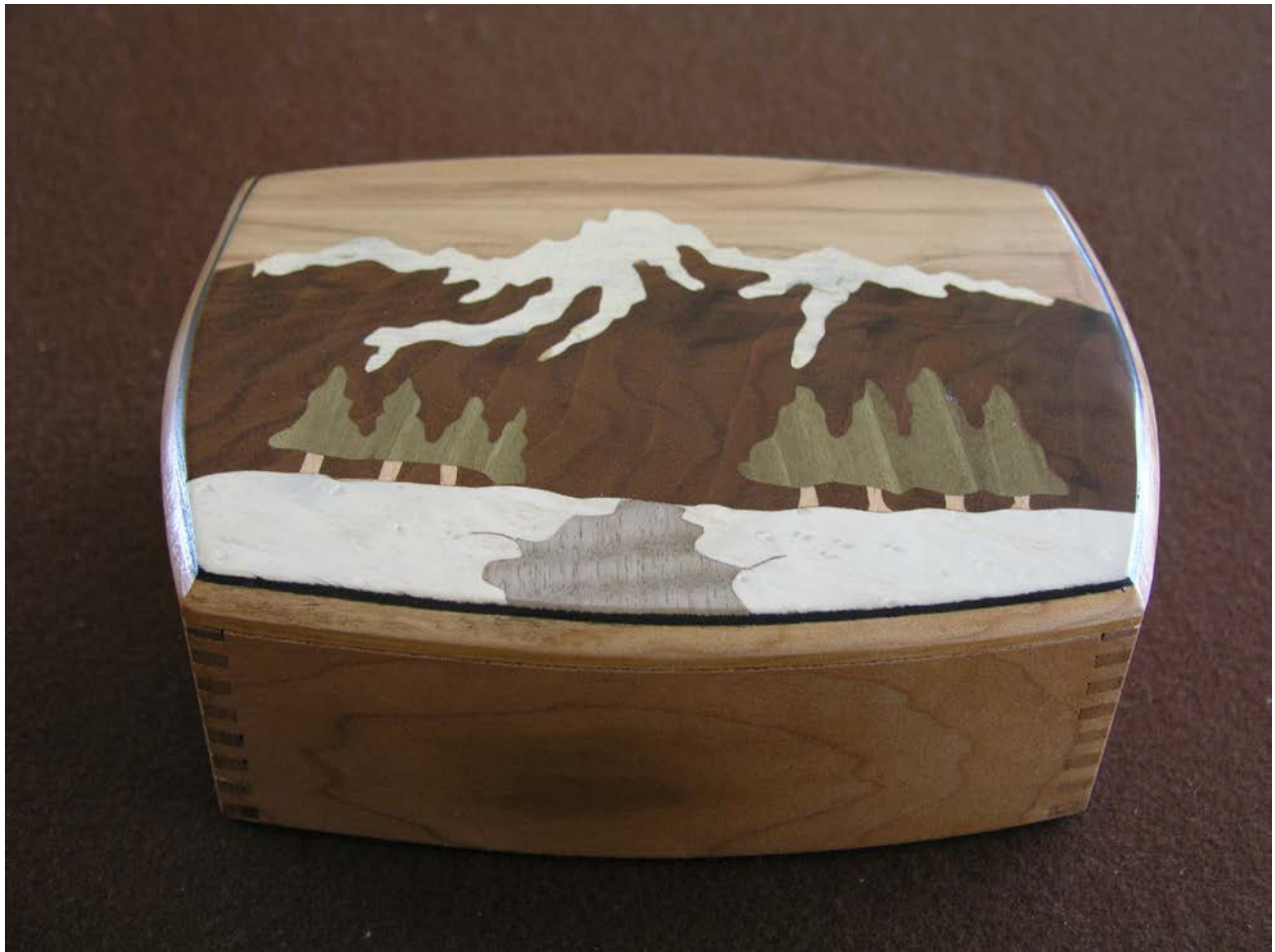
Mountainscape Box – Ken Horner